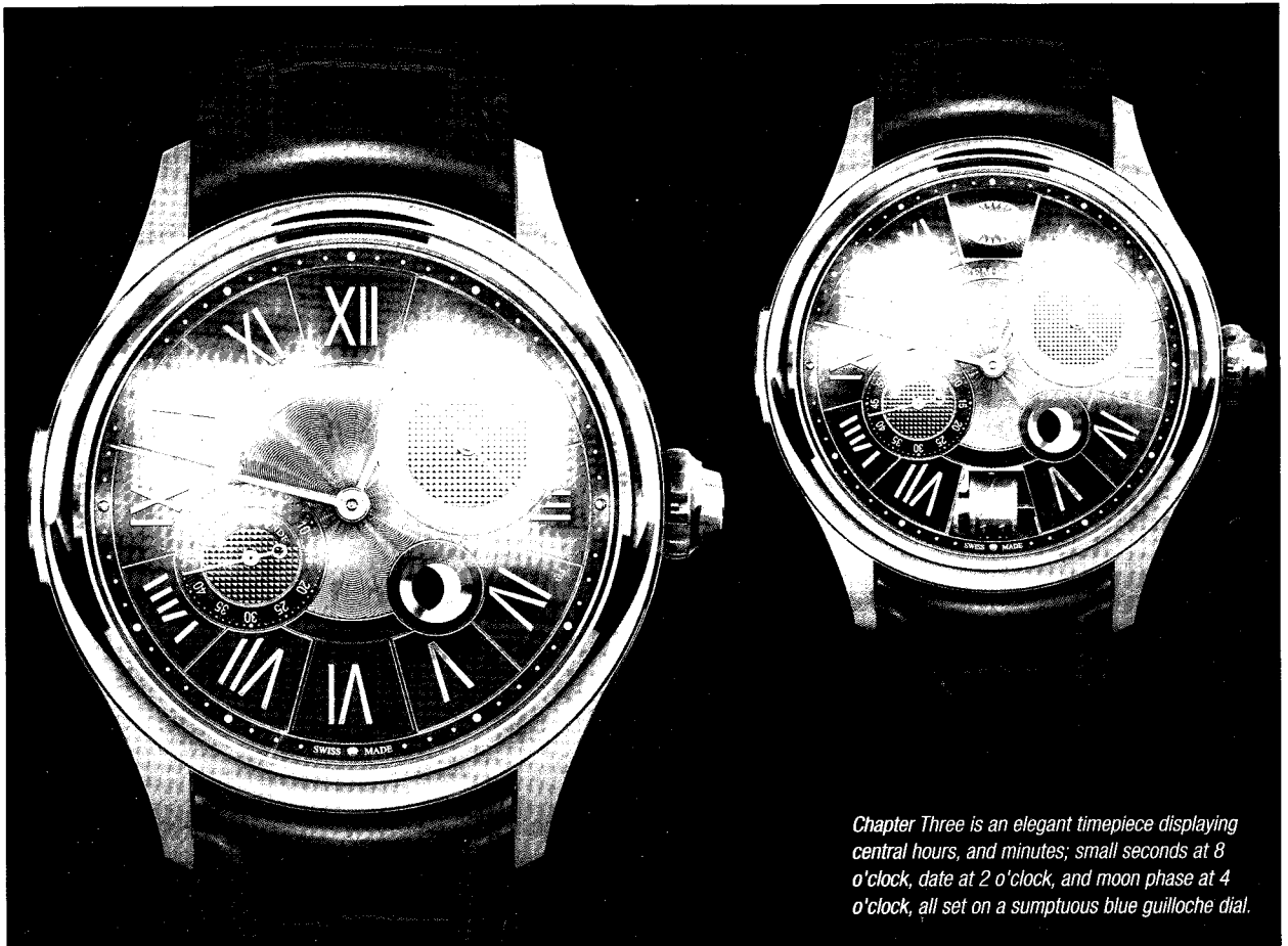
Chapter Three is an elegant timepiece displaying central hours, and minutes; small seconds at 8 o'clock, date at 2 o'clock, and moon phase at 4 o'clock, all set on a sumptuous blue guilloché dial.

His next career step was to go to Geneva, Switzerland, to establish Maîtres du Temps, with the intention of providing a way to bring master watchmakers together to collaborate on innovative projects, which has resulted in a level of technical and design sophistication never