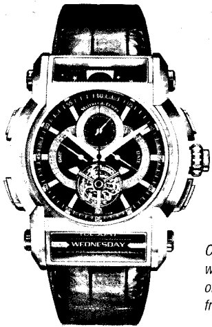
Chapter One is a world-first combination of complications crafted from 558 components.

before seen in watchmaking. Each timepiece is designed and developed by two master watchmakers sourced from across Europe, both of whom bring to the project their respective skills and aesthetics, and, in the end, create a unique masterpiece of horological design.