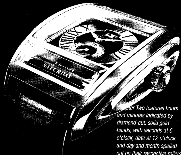
Chapter Two features hours and minutes indicated by diamond-cut, solid gold hands, with seconds at 6 o'clock, date at 12 o'clock, and day and month spelled out on their respective rollers.