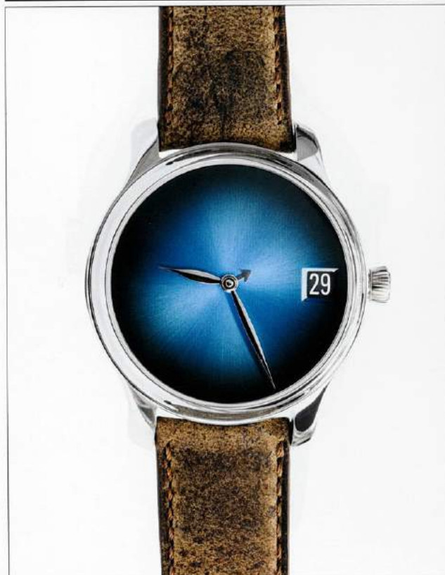
H. MOSER & CIE. Endeavour Perpetual Calendar Concept Funky Blue