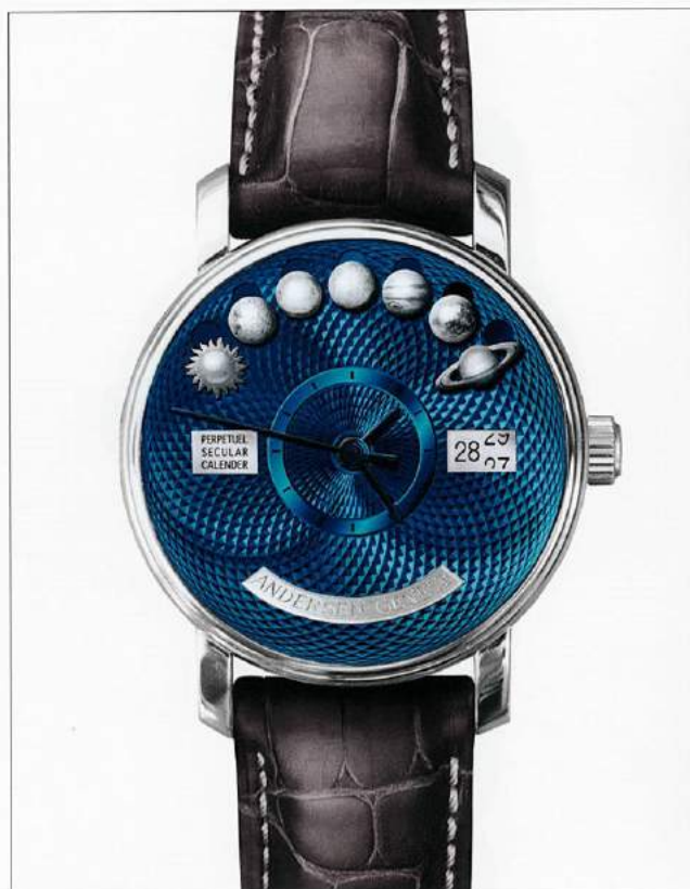
ANDERSEN GENÈVE Perpetuel Secular Calendar "20 th Anniversary" Blue Gold Dial