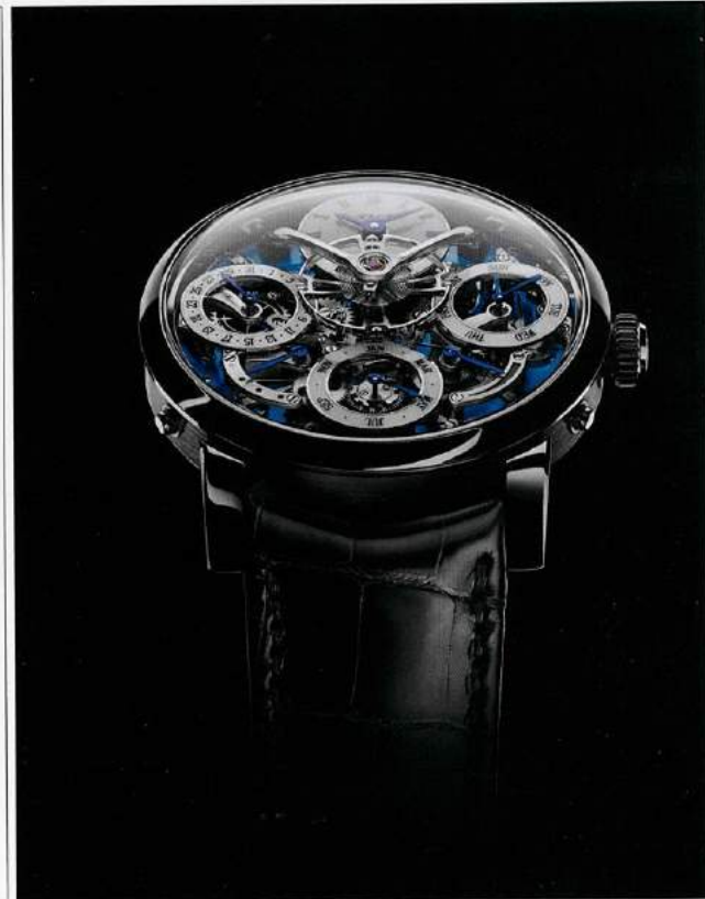
MB&F Legacy Machine Perpetual